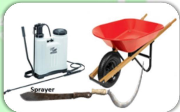
Integrated Farming Tools