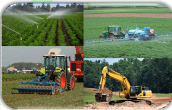
Integrated Farming Machineries